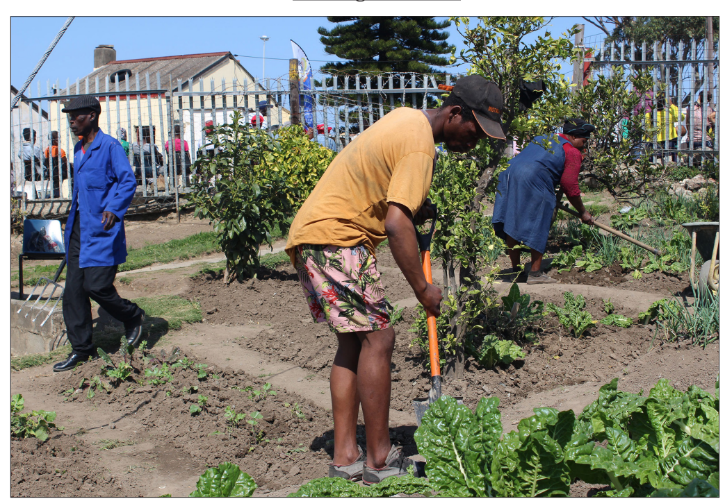
Members os Siyakholwa Development Foundation working in a garden, the vegetables are helping to feed young children in the Early Child Development

iyakholwa Development Foundation has brought a smile in many communities around Mthatha and provided various value-added projects to uplift the Mthatha community. The foundation cultivates food gardens to feed young children in the Early Childhood Development (ECDs) to alleviate challenges of stunted growth and malnutrition. At care centres where there are no cooking facilities, fresh vegetables are shared with parents to prepare at home for their young children.